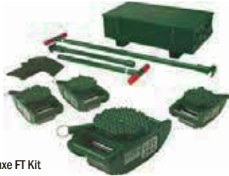
Deluxe FT Kit

Everything required to make heavy moves up to 200 tons is included in Hilman's Deluxe Kits and Economy Sets! Both include four swivel locking Hilman Rollers with either padded or diamond steel tops and two steering handles. Four preload pads are also included with rollers having the SLD style top. Sets contain full length steering handles. Kits contain knock down handles that fit into a sturdy storage case. Kit cases are lockable and have lifting grips for easy handling, providing protection from exposure and theft. Each kit or set provides the necessary gear to tackle a moving project up to that respective capacity.