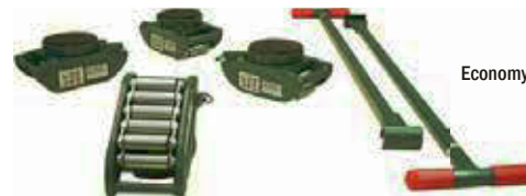
Economy FT Set