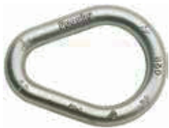
G-341 / S-341

*Based on single leg sling (in-line load), or resultant load on multiple legs with an included angle less than or equal to 120°. Minimum Ultimate load is 5 times the Working Load Limit. †† Welded Link.