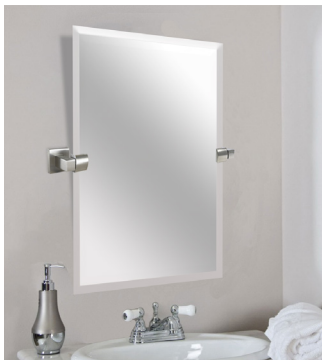
Burton Pivot Shown with Rectangular Frameless Mirror, #M-2231