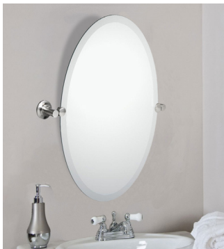
Lanier Pivot Shown with Oval Frameless Mirror, #OM-2231