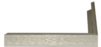
711SN Satin Nickel