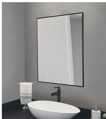
Metal Framed Mirrors