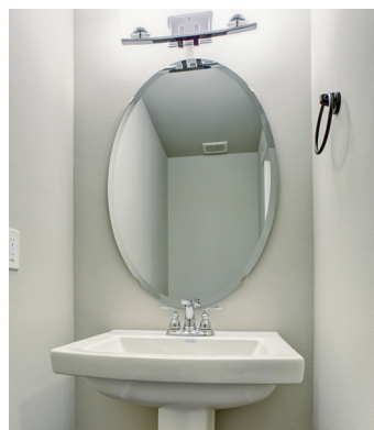
Beveled Oval Mirrors

Buy one at a time or in bulk quantities • Ships in 1-2 days via FedEx Ground or LTL