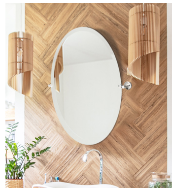
Pivoting Oval Frameless Mirrors