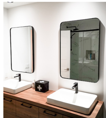
Framed Radius Mirrors