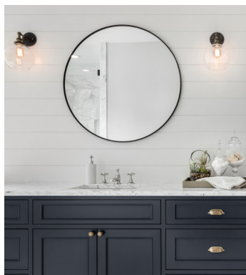
Framed Round Mirrors