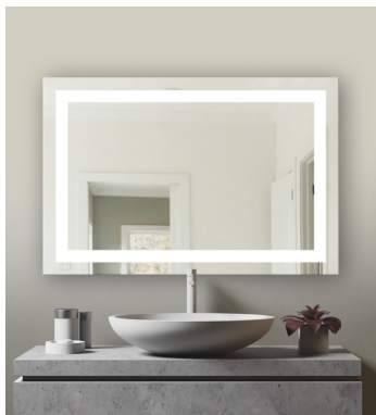
LED Lighted Mirrors