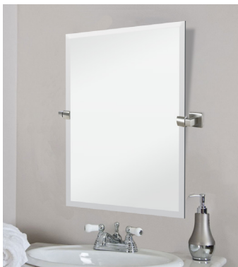
Pivoting Rectangular Frameless Mirrors