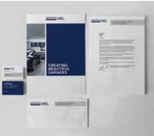
Left: A selection of Garage Living stationery package Right: GL Signature series cabinetry