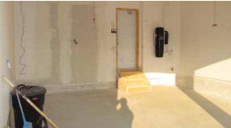
Above: Before and after Garage Living transformation

At Garage Living, we want to provide our clients with as much of a hassle-free experience as possible, which is why we pride ourselves on being a single-source solution for all of our clients’ garage remodeling needs. And, as a Garage Living franchise owner, you’ll have access to all the same tools, resources, programs, and sales techniques to help grow your local full-service, premium Garage Living business!