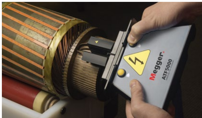
The ATF5000 armature test accessory makes testing armatures with many coils and commutator segments easy and fast

The PPX30A adds armature test functionality to the 30kV power pack, allowing rapid and efficient testing of large DC motors.