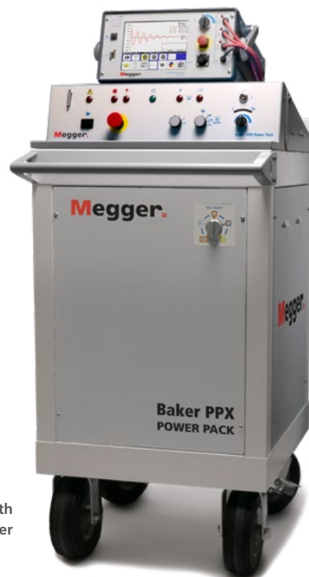
The Baker PPX30 Power Pack shown with the Baker DX static electric motor analyzer