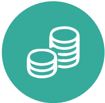
Annual Financial Testing