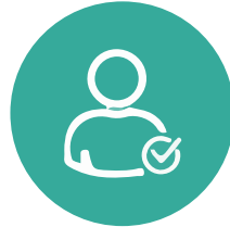
AR Take On