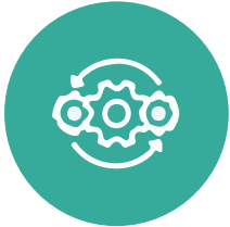
AR Take On Process