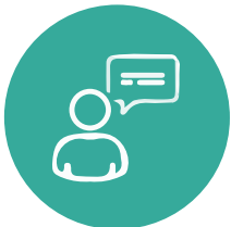
Complaints Management and Reporting