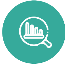
AR Take On