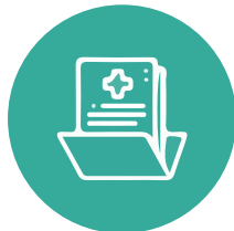
New Business Register