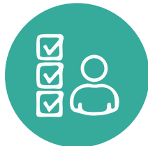
Continuous Professional Development