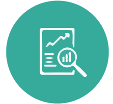
Annual AML Reporting