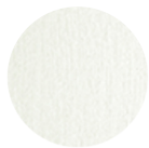
White Wood Grain