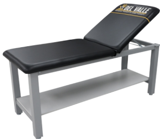
Aluma Elite Basic Treatment Tables