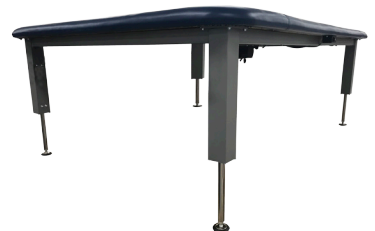
Aluma Elite Elevating Mat Tables