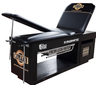
CAB-090N Treatment & Recovery Cabinets