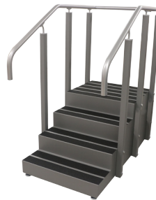
NEW Aluminum Staircases