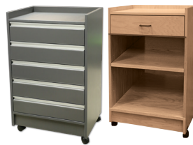
Stor-Edge Modality Carts