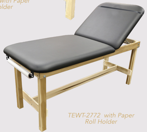
TEWT-2772 with Paper Roll Holder