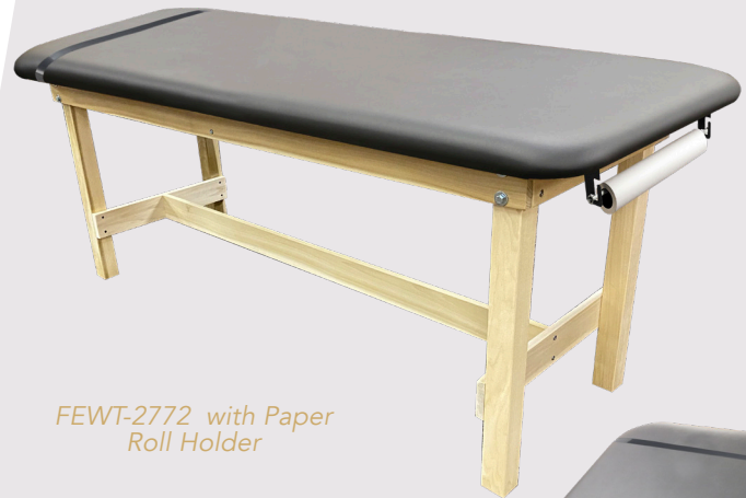
FEWT-2772 with Paper Roll Holder