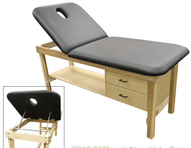
TEWT-2772 with Nose Hole, Bottom Shelf, Cabinet and Drawers on Foot End