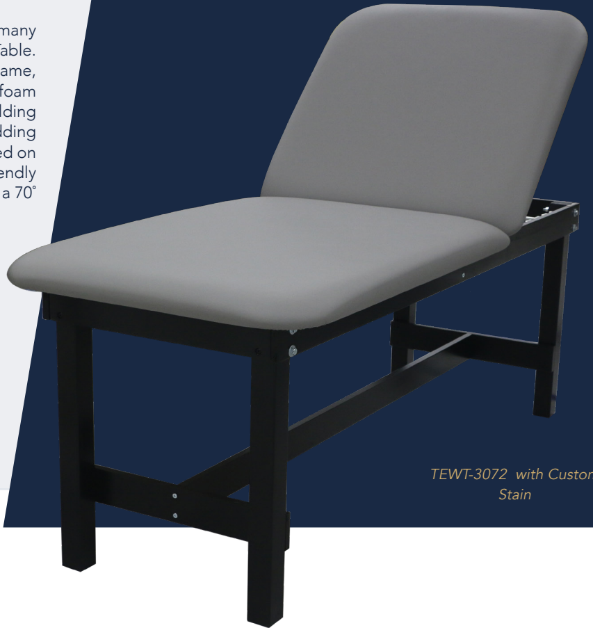
TEWT-3072 with Custom Stain