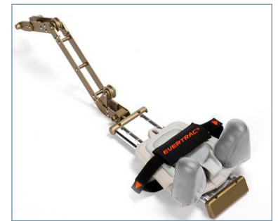
Cervical Attachment & Head Pillow