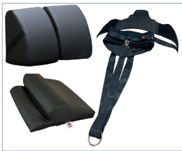
Knee & Cervical Bolster Set and Traction Belt