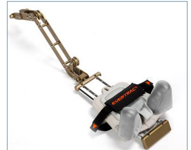
Cervical Attachment & Head Pillow