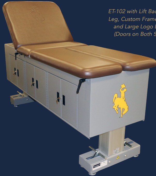
ET-102 with Lift Back, Split Leg, Custom Frame Color, and Large Logo Decal (Doors on Both Sides)