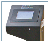
Digital Command Center with Preprogrammed Options