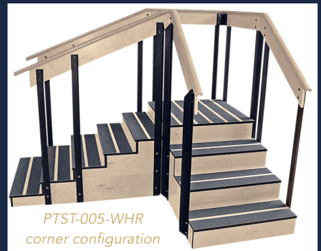
PTST-005-WHR corner configuration