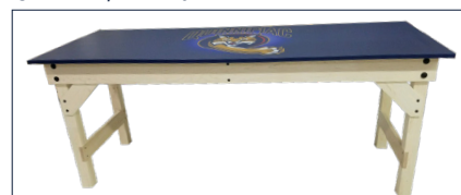
Custom laminate colors and custom printed laminate available on orders of 10 or more tables. Please call for pricing.

**Color Edge Print upholstery colors do not match Standard Upholstery colors.