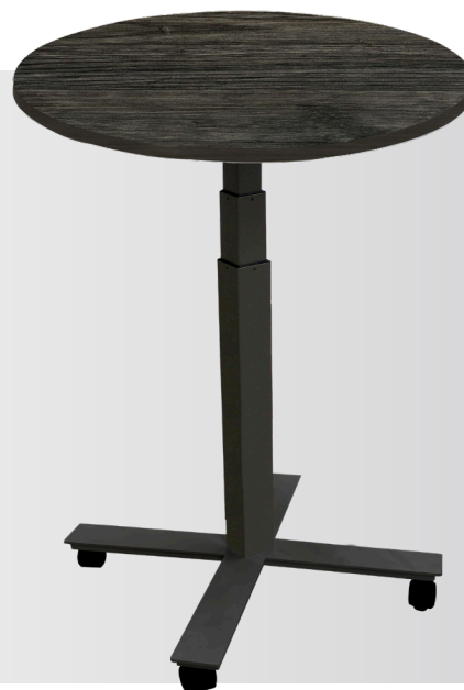
HT1700-36R with Casters

An upright workspace solution in a modern spacesaving design, the HT1700 Hand Therapy Table helps to manage productivity and comfort. A convenient hand control provides effortless sit to stand capability in a matter of seconds. Designed for smaller spaces, with a variable height range adjusting from 23 up to 49.125", you can go from small to tall, and anywhere in between.