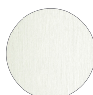
White Wood Grain