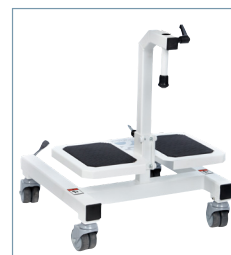
LDS - EPD Stand