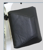
Elevated torso cushion

CE Patents: US 6,758,447,B2 and D455,495