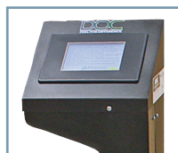
Digital Command Center with Preprogrammed Options