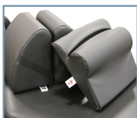
Knee & Cervical Bolster Set