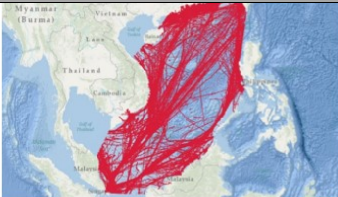
exactView RT significantly enhances vessel detection in dense shipping areas