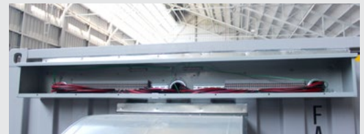
(Top) Inside a finished Anvil Crawler inverter house. (Bottom left) Pre-installed and wired Fronius weather station and monitoring. (Bottom right) Pre-wired inverter DC terminal strip.